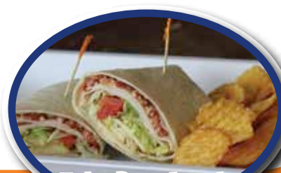
Turkey Bacon Avocado

Any 4 Veggies, Lettuce and Tom Included. Topped with Chipotle Mayo, Pesto, Or Avocado Ranch